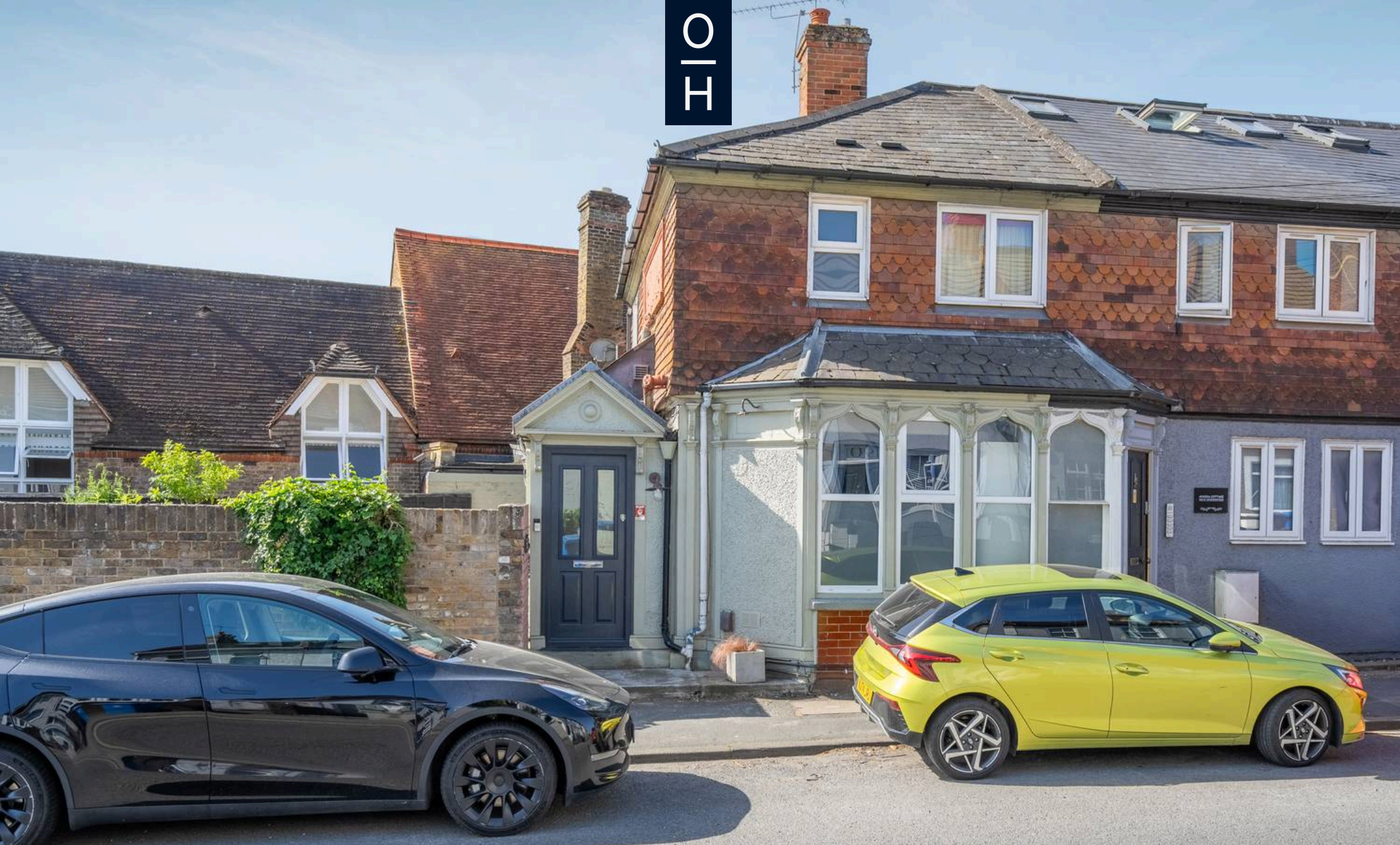
St. Leonards Road, Windsor £500,000