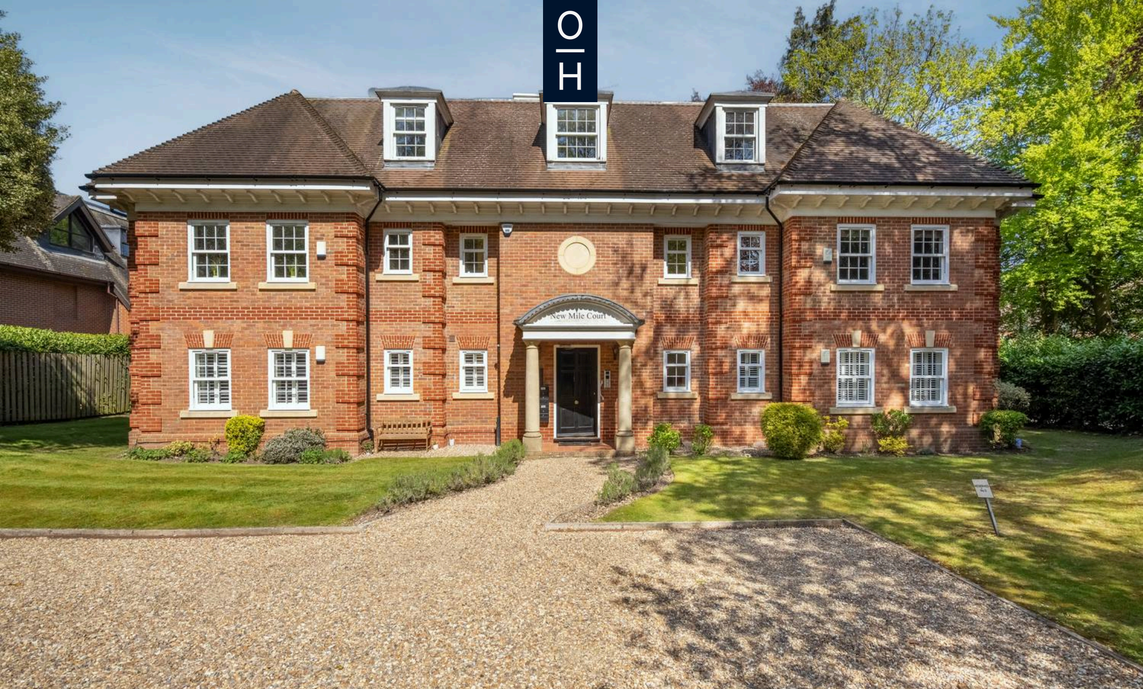
New Mile Court London Road, Ascot Guide Price £500,000