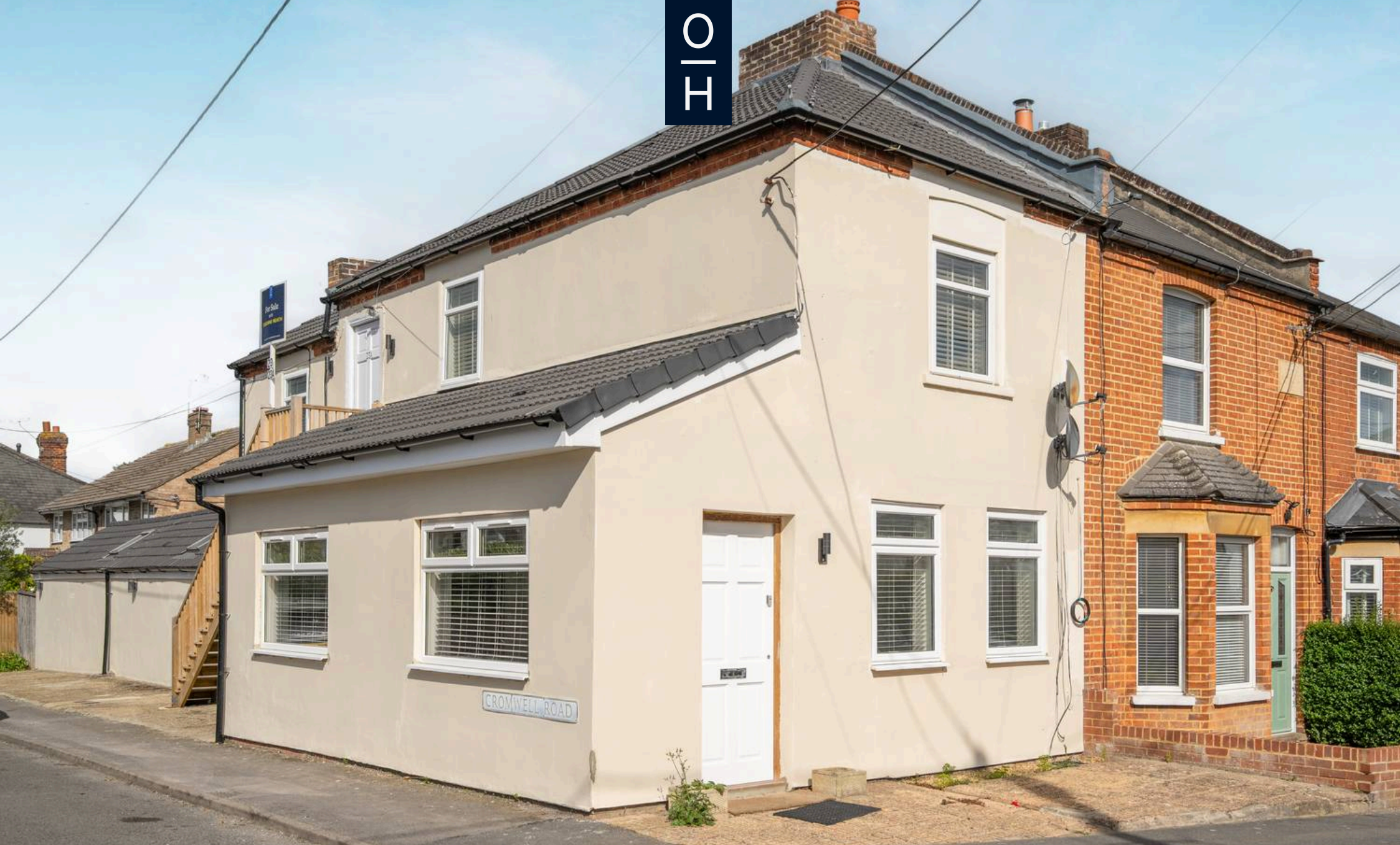
Victoria Road, Ascot Guide Price £325,000