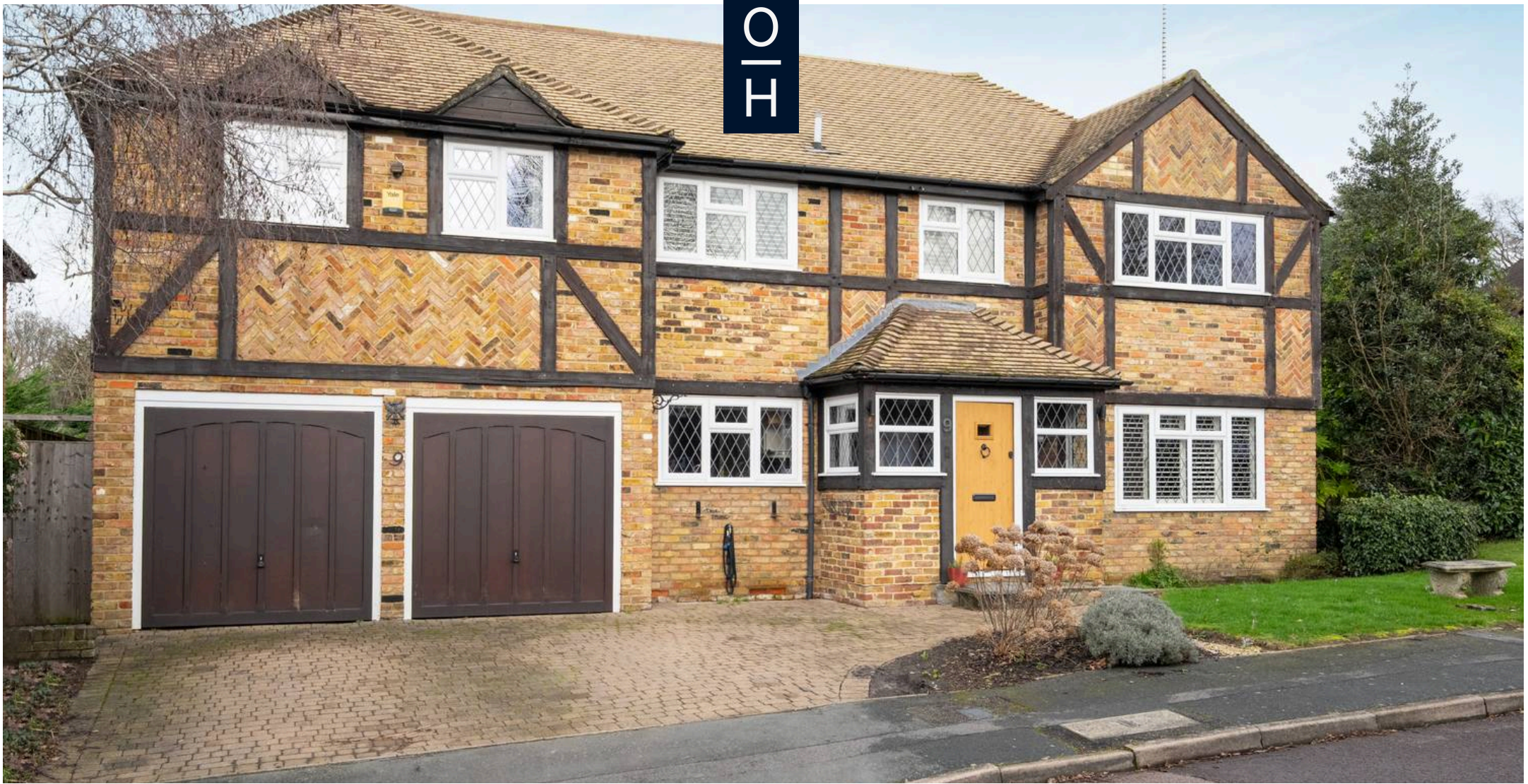
Leycester Close Windlesham