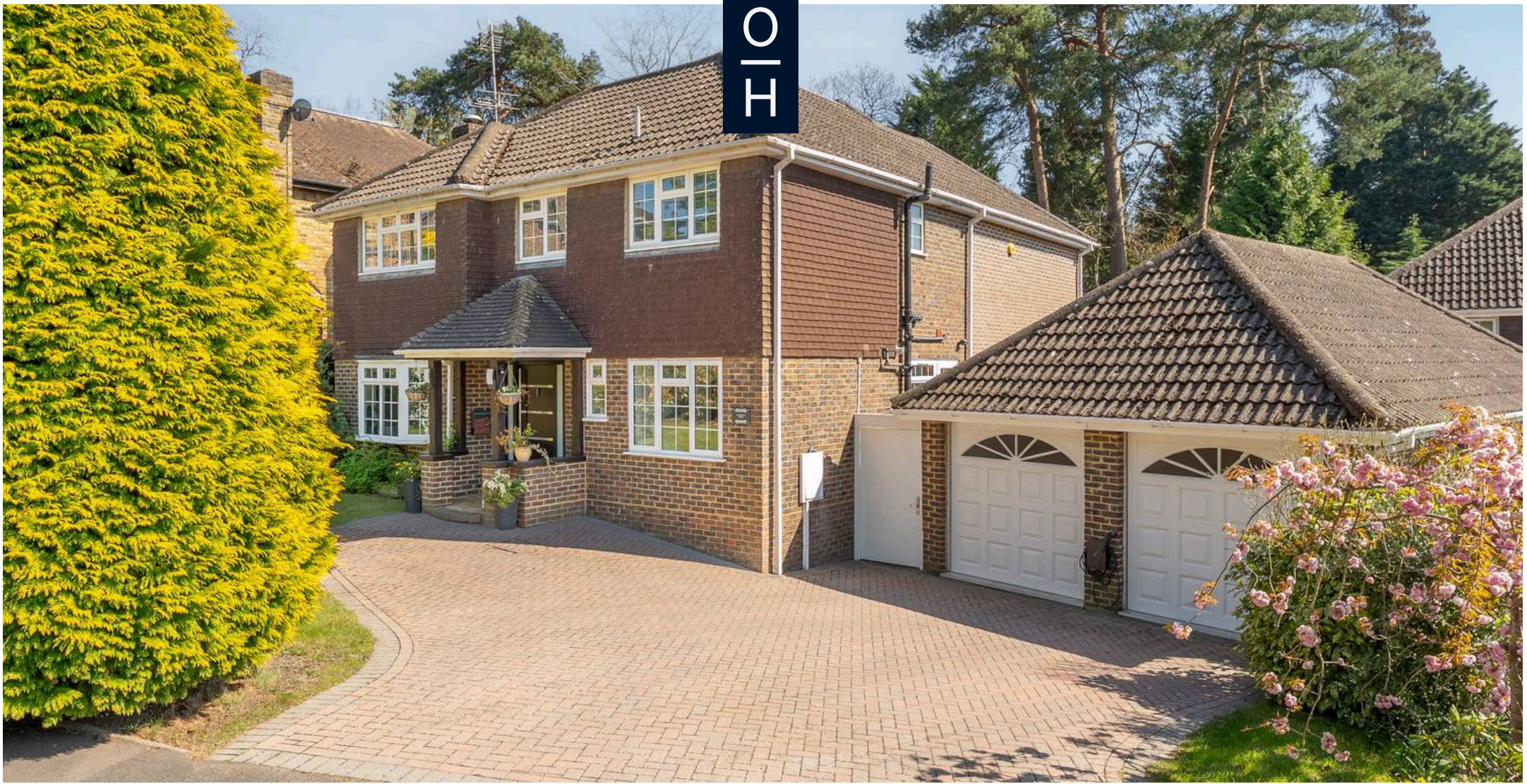
Armitage Court Sunninghill